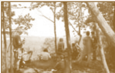
Kindly carry out what you carry in.

Deer ticks, which can transmit Lyme Disease, are a growing problem. Take precautions and check for ticks after leaving.