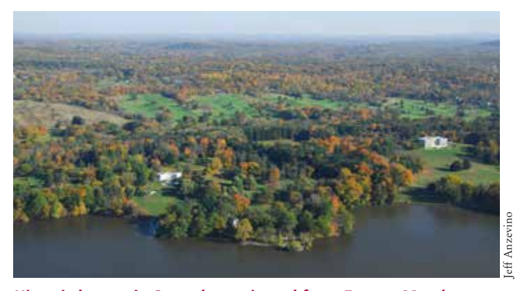
Historic homes in Staatsburg viewed from Esopus Meadows.

Americans who prospered from the nation's industrial and transportation revolutions in the mid-1800s showed off their new wealth by purchasing land along Dutchess County's Hudson shoreline and erecting grand homes. One of these—Mills Mansion—is visible across the river; another, Vanderbilt Mansion, stands south of here in Hyde Park. Although they only visited for a few weeks each summer or fall, the owners of these palaces spared no expense in creating beautifully landscaped grounds, where they enjoyed horseback riding, hunting and the same magnificent views that thrill visitors to these historic homes today.