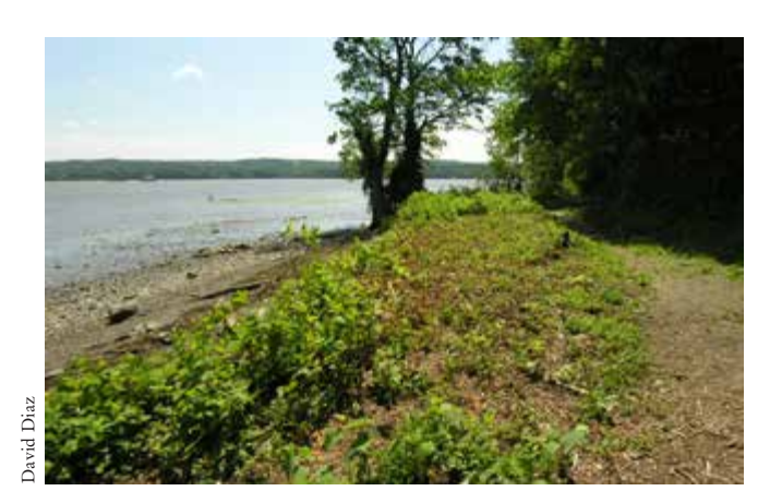
A shoreline restoration project to remove invasive Japanese knotweed ( Polygonum cuspidatum ).