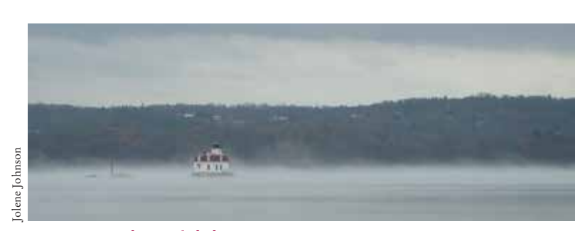
Esopus Meadows Lighthouse

The shoreline at Esopus Meadows will play an important role if the Hudson's water level continues rising because of the expected effects of climate change. As a floodplain —land that is periodically flooded—it serves as a sponge, storing and gradually releasing floodwaters. Natural floodplains also act as filters, trapping sediments and pollution, while trees and plants along their banks prevent erosion and provide essential habitat for native plant and wildlife species. As the river rises, Esopus Meadows Preserve will provide room for these animals and plants to migrate inland, ensuring the preservation of the Hudson Valley's great "biological melting pot."