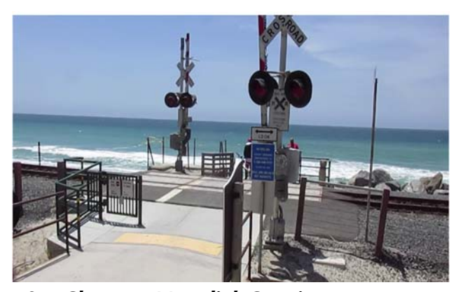
San Clemente Metrolink Crossing

https://www.octa.net/Projects-and-Programs/All-Projects/Rail-Projects/Railroad-Crossing-Enhancements/San-Clemente-Pedestrian-Crossings/