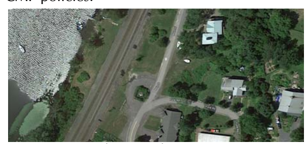
Germantown Site Location (MP 105)

Amtrak has indicated it is proposing these actions to improve public safety along the Empire Corridor South. The recommendations from Federal Rail Administration (FRA) state: "Eliminate redundant or unnecessary all crossings, together with any crossings that cannot be made safe due to crossing geometry or proximity of complex highway intersections" "Install the most sophisticated traffic control/warning devices compatible with the location, (e.g. four quadrant gates) where train operating speeds are between 80 and 110 mph."<sup>3</sup> Amtrak's application would "eliminate...redundant or unnecessary crossings," nor does the proposal include "the traffic sophisticated control/warning devices." As currently proposed, Amtrak would construct the gates and fences without conducting a regional assessment of access needs or undertaking an analysis of their impacts on coastal resources and achievement of NYS CMP policies.