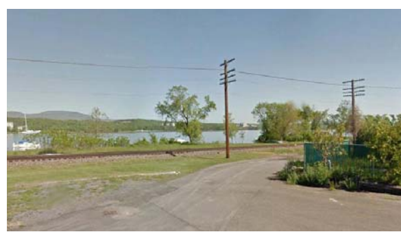
Germantown Site Location (MP 105)

McLaren also was asked to provide a preliminary overview of the proposed project's potential impact on coastal resources and achievement of New York's CMP policies. The findings are outlined in this white paper.