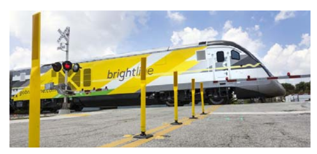
Florida Brightline

The Florida Brightline is an express intercity rail line operating at speeds up to 79 mph between Miami and West Palm Beach, with an intermediate stop at Fort Lauderdale. Developed by All Aboard Florida, a wholly owned subsidiary of Florida East Coast Industries, it is the nation's only privately owned and operated intercity passenger railroad. The Brightline runs along the state's densest population corridor, which contains more than 6 million residents and a regular influx of tourists.