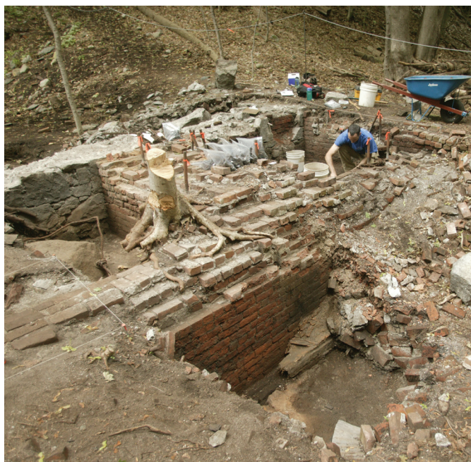
Top left: Parrott gun on Morris Island, SC. Above: Michigan Tech student excavating the boring mill.

Finished Parrott guns were taken to the gun platform and test-fired at targets painted on Crow’s Nest Mountain, across the Hudson River.