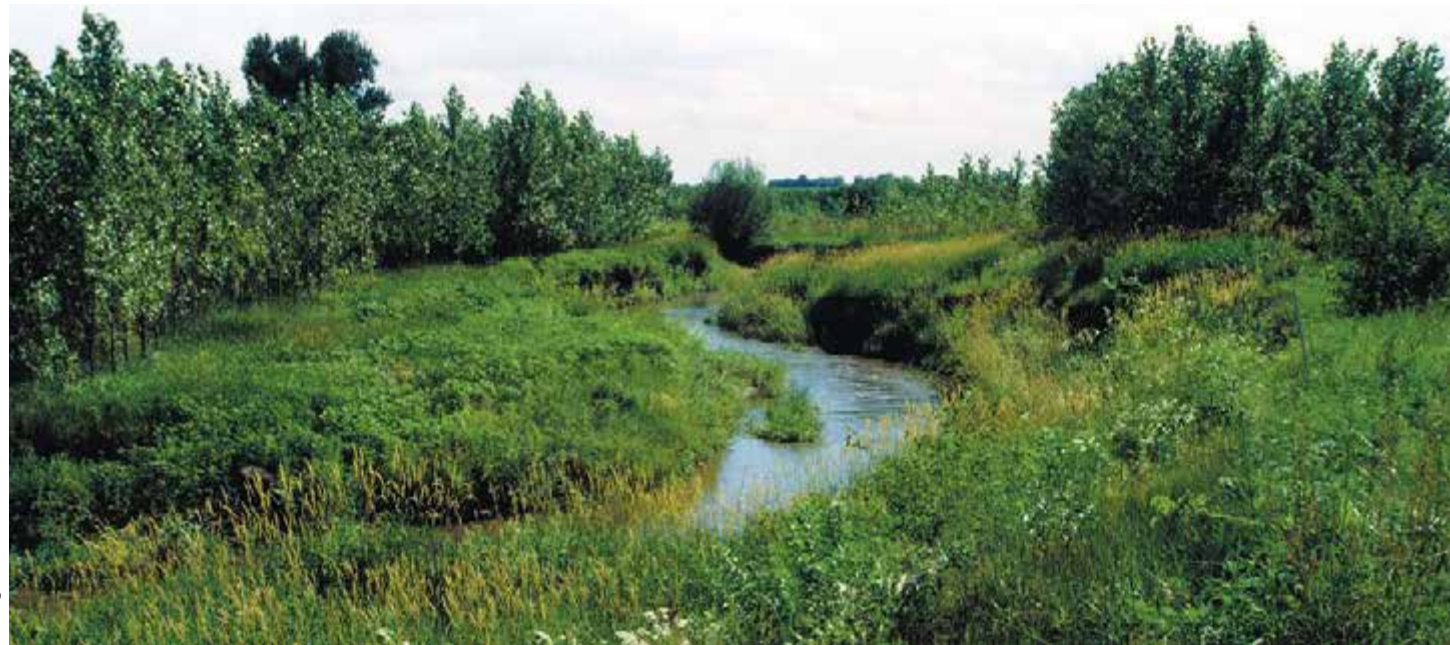
A healthy riparian buffer zone.