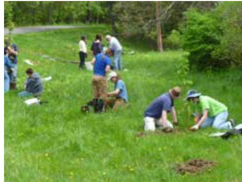
Volunteers planting at Trees for Tribes site.