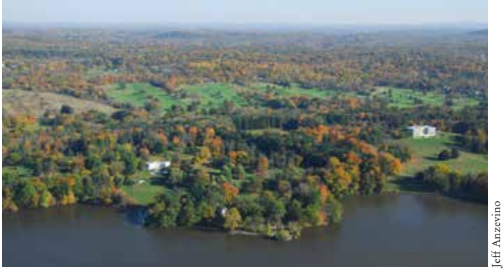
Historic homes in Staatsburg viewed from Esopus Meadows.

Americans who prospered from the nation's industrial and transportation revolutions in the mid-1800s showed off their new wealth by purchasing land along Dutchess County's Hudson shoreline and erecting grand homes. One of these-Mills Mansion—is visible across the river; another, Vanderbilt Mansion, stands south of here in Hyde Park. Although they only visited for a few weeks each summer or fall, the owners of these palaces spared no expense in creating beautifully landscaped grounds, where they enjoyed horseback riding, hunting and the same magnificent views that thrill visitors to these historic homes today.