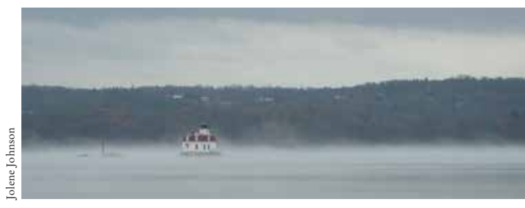
Esopus Meadows Lighthouse

The shoreline at Esopus Meadows will play an important role if the Hudson's water level continues rising because of the expected effects of climate change. As a floodplain —land that is periodically flooded—it serves as a sponge, storing and gradually releasing floodwaters. Natural floodplains also act as filters, trapping sediments and pollution, while trees and plants along their banks prevent erosion and provide essential habitat for native plant and wildlife species. As the river rises, Esopus Meadows Preserve will provide room for these animals and plants to migrate inland, ensuring the preservation of the Hudson Valley's great "biological melting pot."