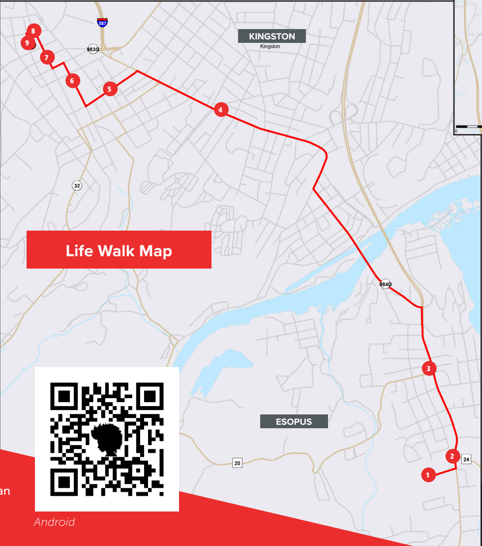
Pine Street African Burial Ground